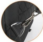
Durable metal buckle