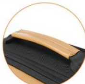
Comfortable PU handle