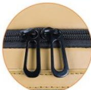
Smooth double zippers