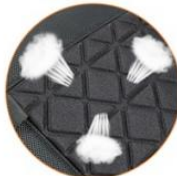
Breathable back cushion