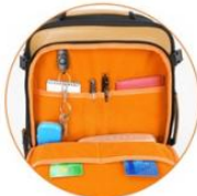
Large capacity compartments