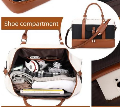
Large capacity main bag