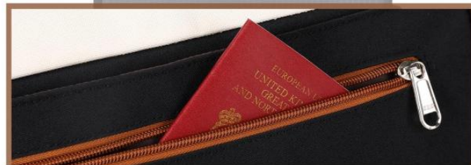
Anti-theft zipper pocket on back