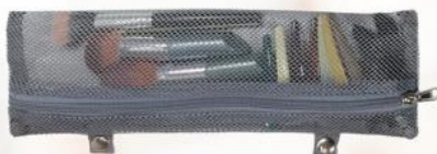
REMOVABLE STORAGE BAG