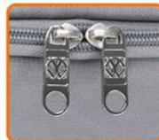
METAL DEBOSSD ZIPPER PULLER