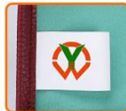
WASHING CARE LABEL