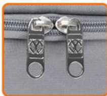
METAL DEBOSSD ZIPPER PULLER