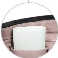
Inner slip pockets