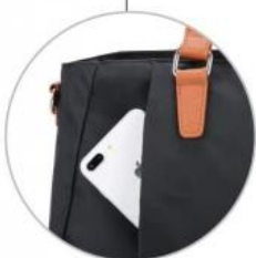
External zipper pocket