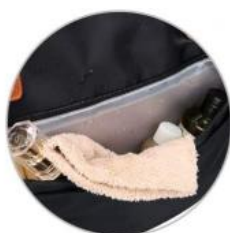
Waterproof wet pouch