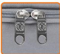
METAL DEBOSSED ZIPPER PULLER