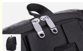
Durable Double Smooth Zip